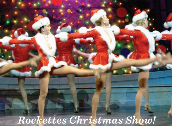
Rockettes Christmas Show!