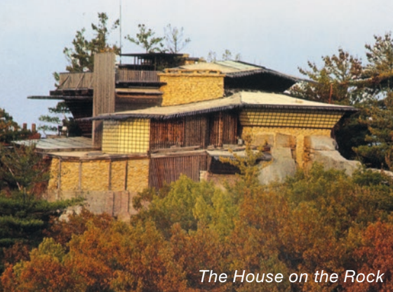
The House on the Rock