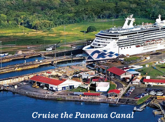
Cruise the Panama Canal